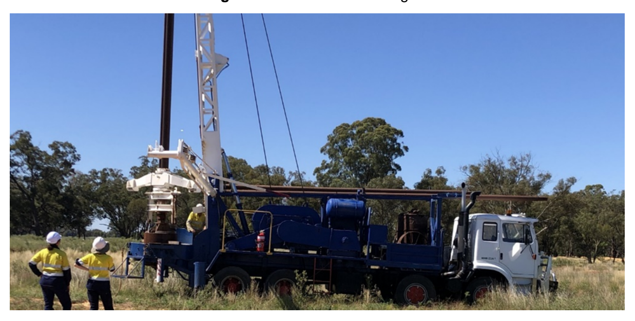
Figure 3: Platina Lead Drilling