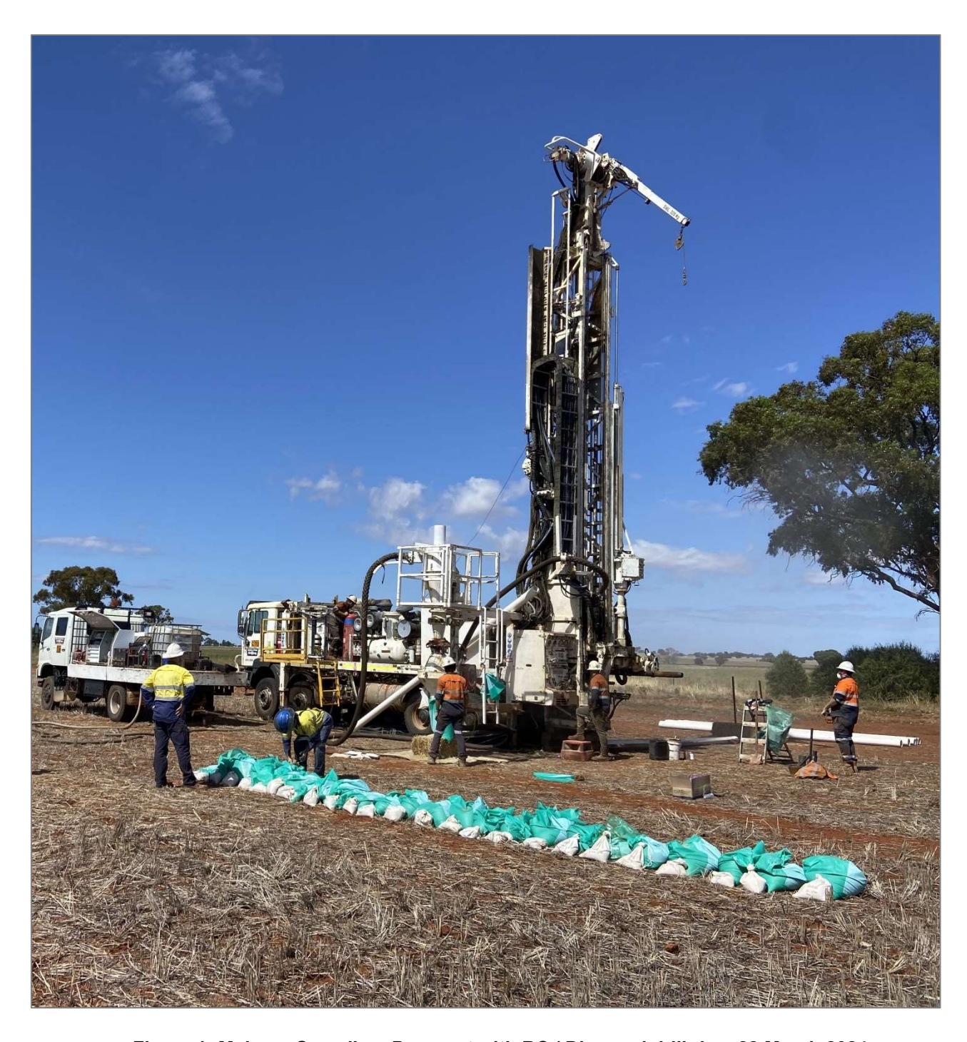
Figure 1: Melrose Scandium Prospect with RC / Diamond drill rig - 22 March 2024